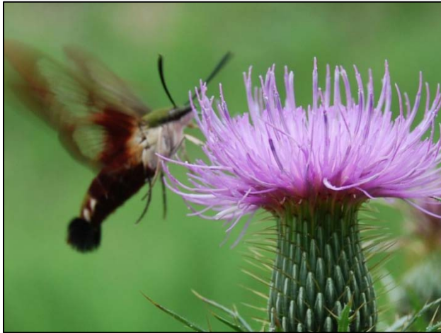
Field thistle flower and hummingbird clearwing moth.

Contributed by: USDA, NRCS, Norman A. Berg National Plant Materials Center, Beltsville, MD